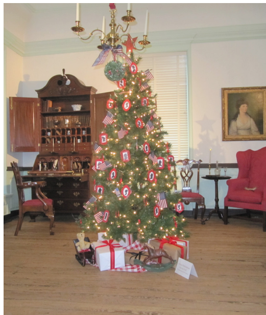
Left: Woodford Mansion is an 18th-century Colonial mansion in Fairmount Park.