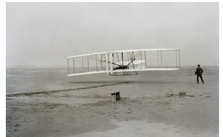
Famous flight of the Wright Flyer I, December 17, 1903, Orville piloting, Wilbur running at wingtip.

The book documents the challenges that had to be overcome in order to fly: how to build a small engine for thrust and power, how to design a propeller, and how to control the plane once airborne. The author tells the story in understandable terms, a story of grit, patience, and perseverance.